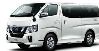
Solid White (QM1W)