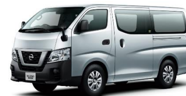
Brilliant Silver (K23W)