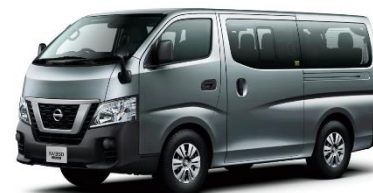
Metallic Grey (KAD)